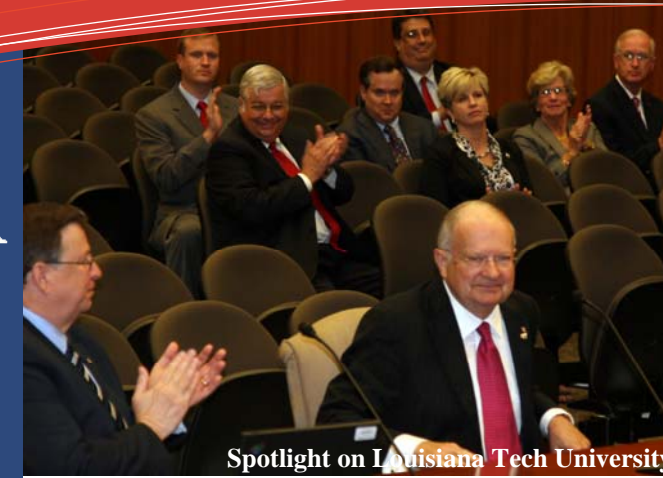
Spotlight on Louisiana Tech University