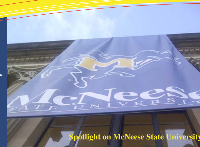
Spotlight on McNeese State University

Grambling State University Louisiana Tech University McNeese State University Nicholls State University Northwestern State University Southeastern Louisiana University University of Louisiana at Lafayette University of Louisiana at Monroe University of New Orleans